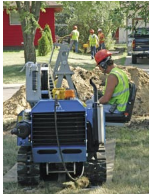
The compact 4X provides maximum drilling power in tight working conditions.