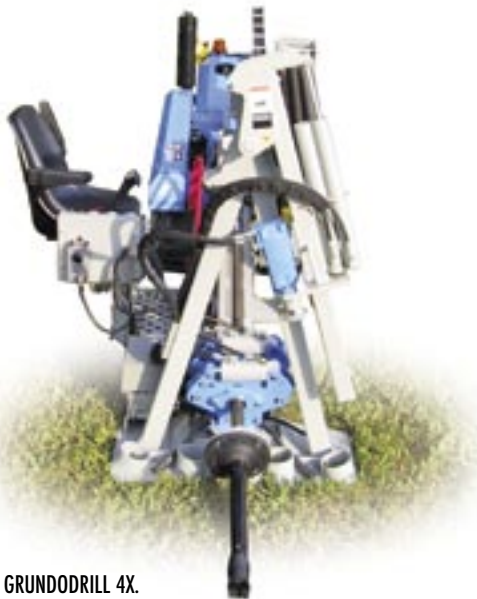
37.5 total HP GRUNDODRILL 4X.

Specifications subject to change at any time.