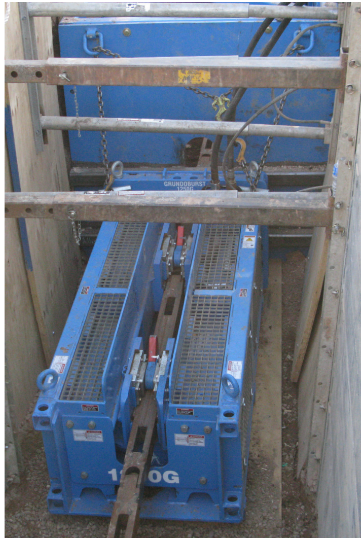
A Grundoburst 1250G static pipe bursting unit from trenchless equipment manufacturer TT Technologies, Aurora, Ill., was used as the pulling unit for the Amarillo, TX project.