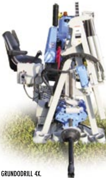
37.5 total HP GRUNDODRILL 4X.

Specifications subject to change at any time.