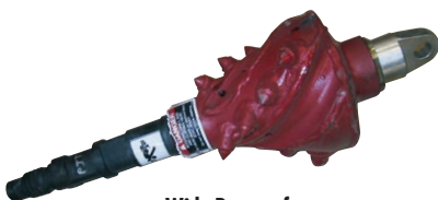
Wide Range of Backreamers Available

The GRUNDOPIT pit-launched mini-directional drill from TT Technologies is the ideal solution for difficult sewer, water, electrical, phone/CATV, service and lateral line installations. The highly compact GRUNDOPIT can be operated from a small launch pit. The powerful unit is capable of completing bores up to 150 feet and installing pipes up to 8 inches in diameter. Its light weight, compact design makes it easy to transport from jobsite to jobsite.